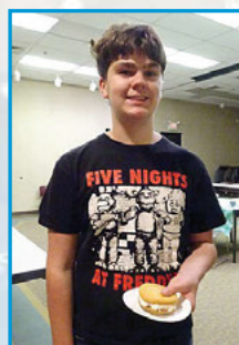
Ready to chow-down his Cream Cheese Cookie – Kitchen Creations