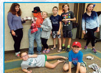
A creative bunch with scarecrow they made for Scarecrows on Parade