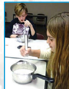
Whisking homemade whipped cream for strawberry shortcakes – Kitchen Creations