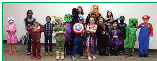
Strange characters... Library Kids' Club Grades K-4 – After School Tuesdays