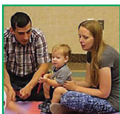
Tommy drummin' it out with Daddy & Mommy! Kiddles ages 6-23 months