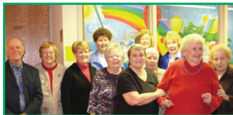
The friends of WDPL were present at the Ribbon-Cutting Ceremony of the Children's Computer Room Renovation.

A sunny day brings light, enthusiasm and the joy of sharing.