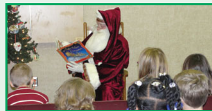
Christmas Lights Bus Tour

The West Deptford Historical Association had a great 2013 and we are looking forward to another unique year as we enter 2014. Our fall activities were once again appreciated by residents where our Scarecrows on Parade helped celebrate the early autumn season. We ended our year with our Christmas Lights Bus Tour and our Winter Wreath Event on RiverWinds Drive. What a great way to celebrate the winter season.