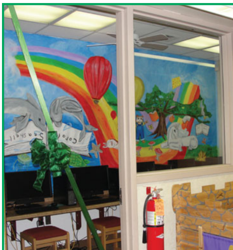
The friends of WDFPL are delighted to unveil the newly renovated and updated Children's Computer Room.

If the Library is still operational after the event of an emergency, library services will be available to help affected community members in their recovery.